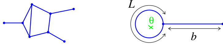
Figure 1: Examples. Left : a graph with V = 8 vertices and B = 9 bonds. Right : a ring pierced by a magnetic flux \theta attached to a wire ( B = V = 2 ).

Spectral determinant. — The spectral determinant of the Laplace operator \Delta is formally defined as S_{\mathcal{G}}(\gamma) = \det(\gamma - \Delta) , where \gamma is the spectral parameter. This object has been introduced in Ref. [9] in order to study magnetization of networks of metallic wires. Despite the Laplace operator acts in a space of infinite dimension, S_{\mathcal{G}}(\gamma) can be related to the determinant of a finite size matrix [9] :